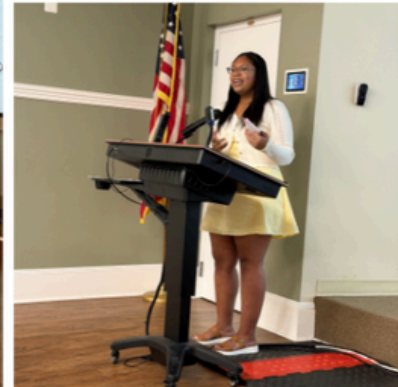
Above: Collage of images from the MOSAIC Annual Breakfast on June 4, 2026, including a group of people on a stage, a projection screen with the MOSAIC logo, a speaker presenting to an audience, and a person speaking at a podium.