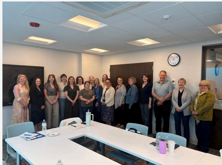
Above: Local History Committee Members