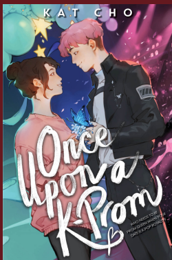
ONCE UPON A K-PROM BY KAT CHO