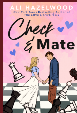
CHECK & MATE BY ALI HAZELWOOD