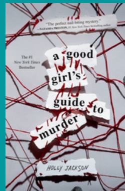
A GOOD GIRL'S GUIDE TO MURDER BY HOLLY JACKSON