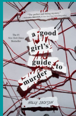
A GOOD GIRL'S GUIDE TO MURDER BY HOLLY JACKSON